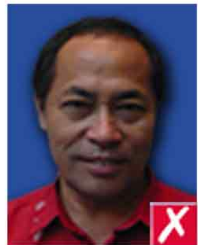
Eye and neck area too dark. (white of eyes not visible)