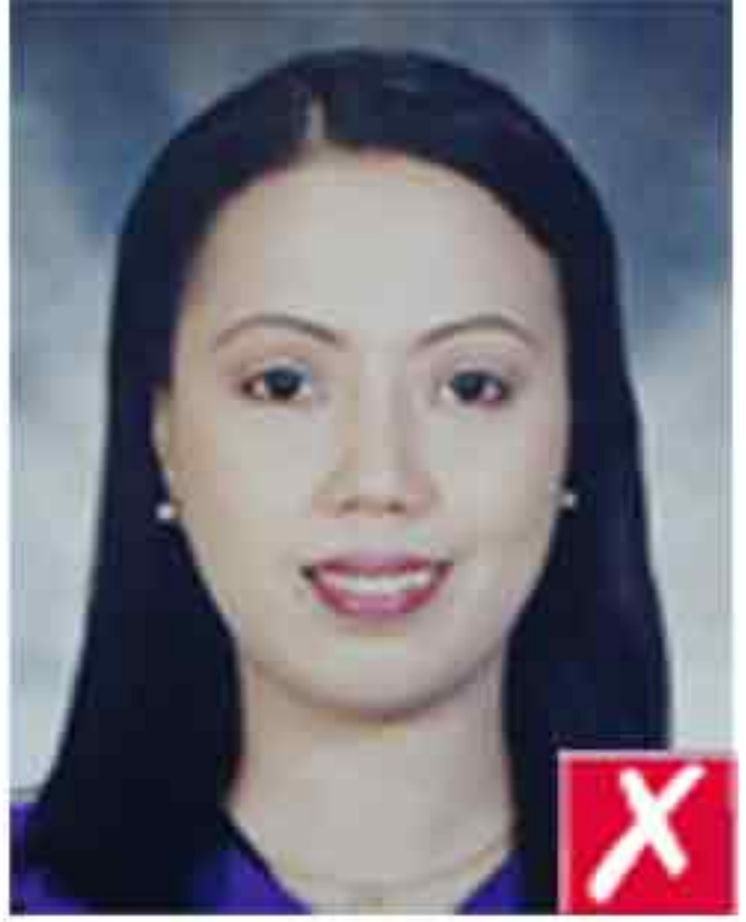
Wrong color of background