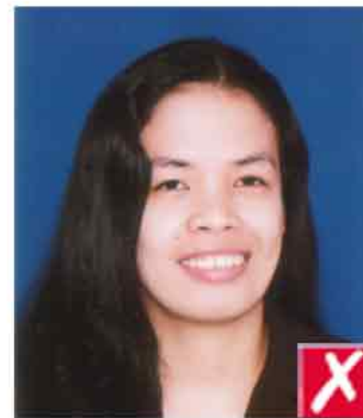
Ears not shown