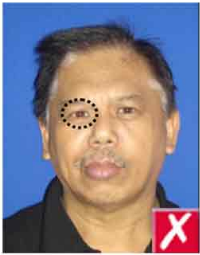
Photo with Red Eye Effect