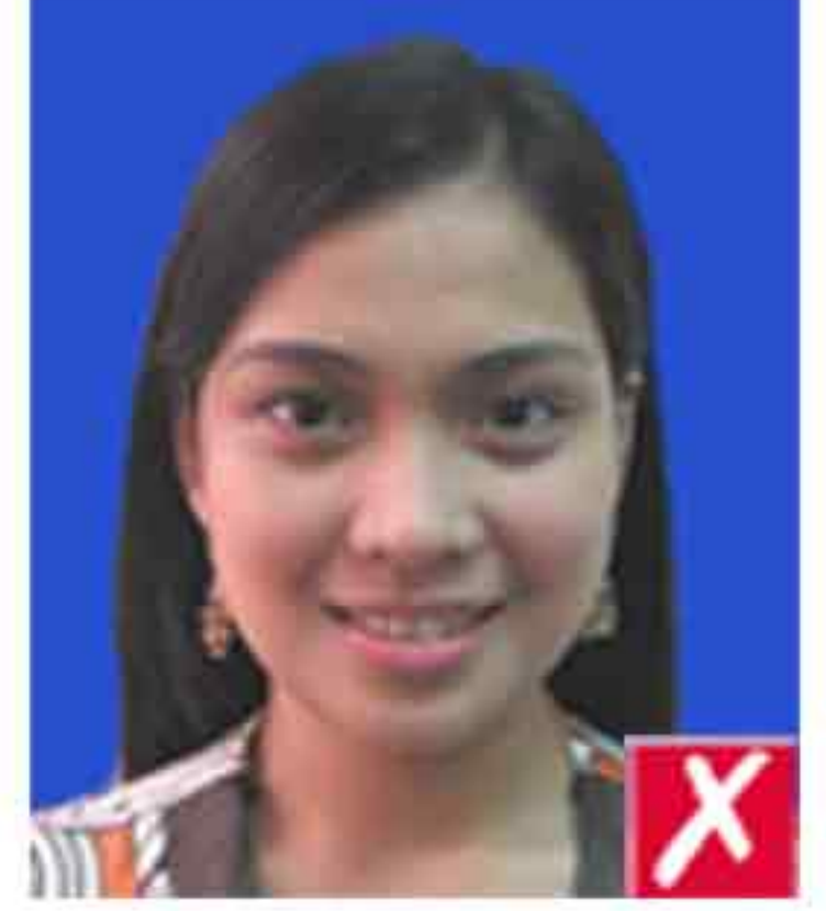
Uneven skin color