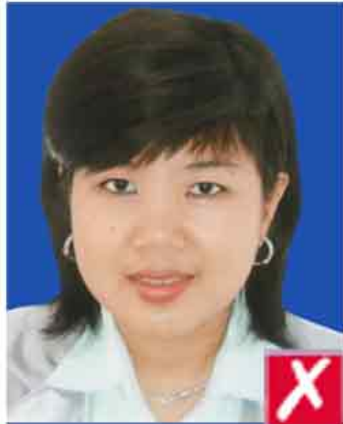
Hair across the eyebrow/eye area