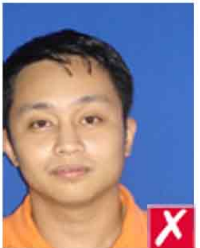
Facial image not centered