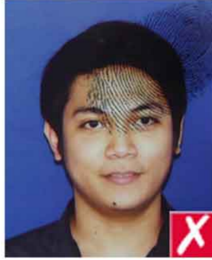
Photo should be free from ink marks, dirt, grease, fingerprints and paste stains. DO NOT USE ERASER/APPLY CHEMICAL ON THE PHOTO TO CLEAN IT.