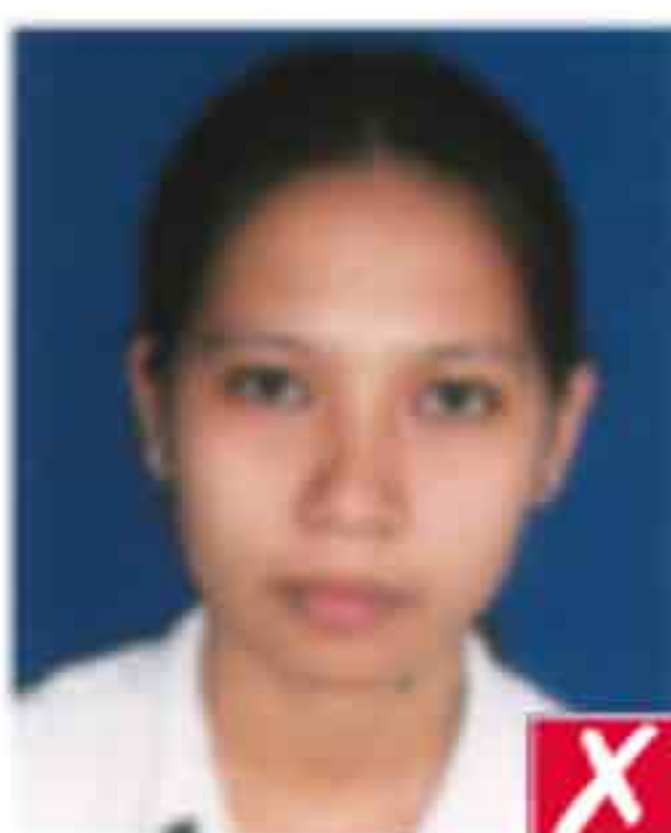
Flash too strong