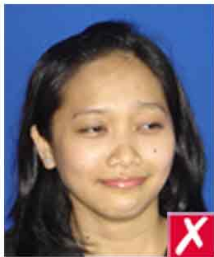
Not looking directly at the camera