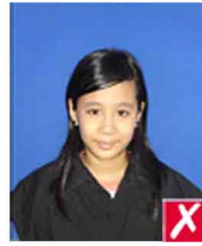
Image of face is too small