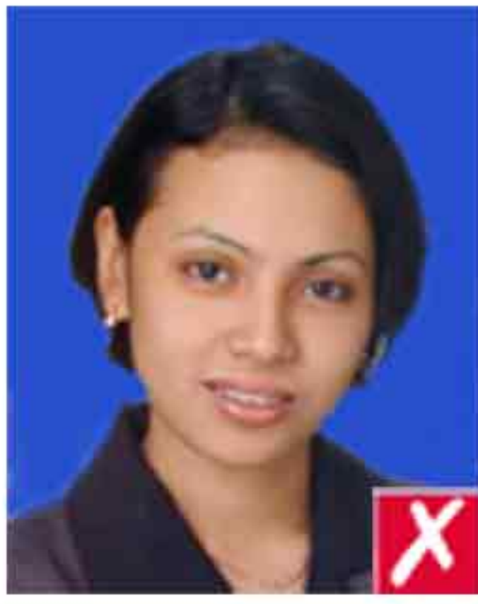
Facial image is tilted