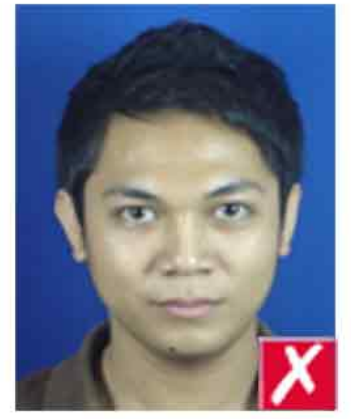
Unnatural skin tone