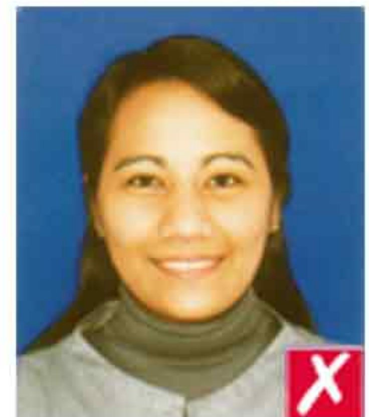
Yellowish Skin tone