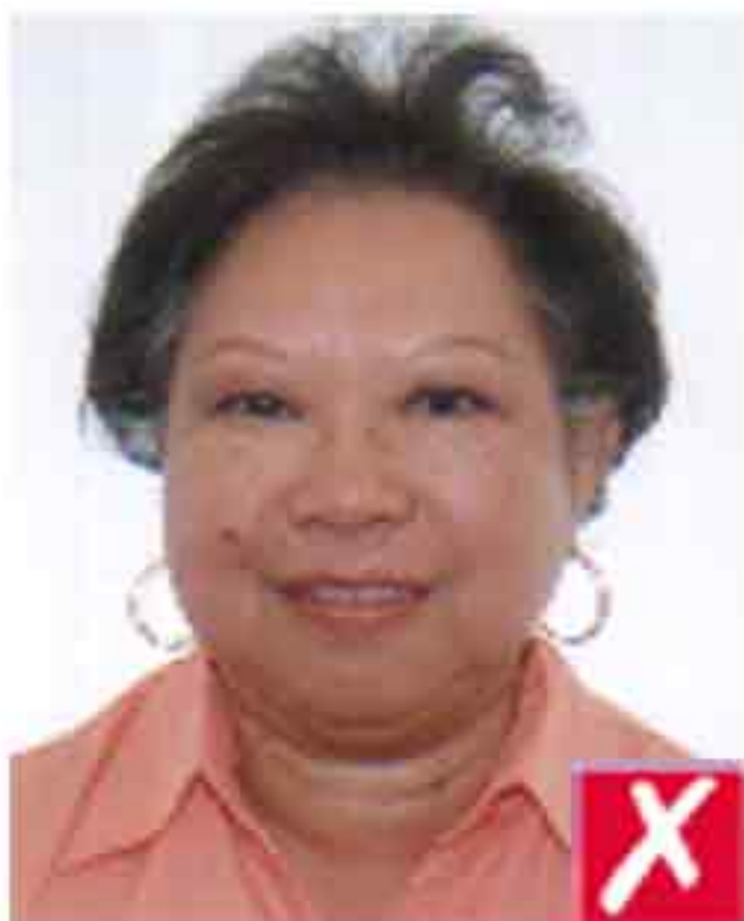
Wrong color of background Earrings too big