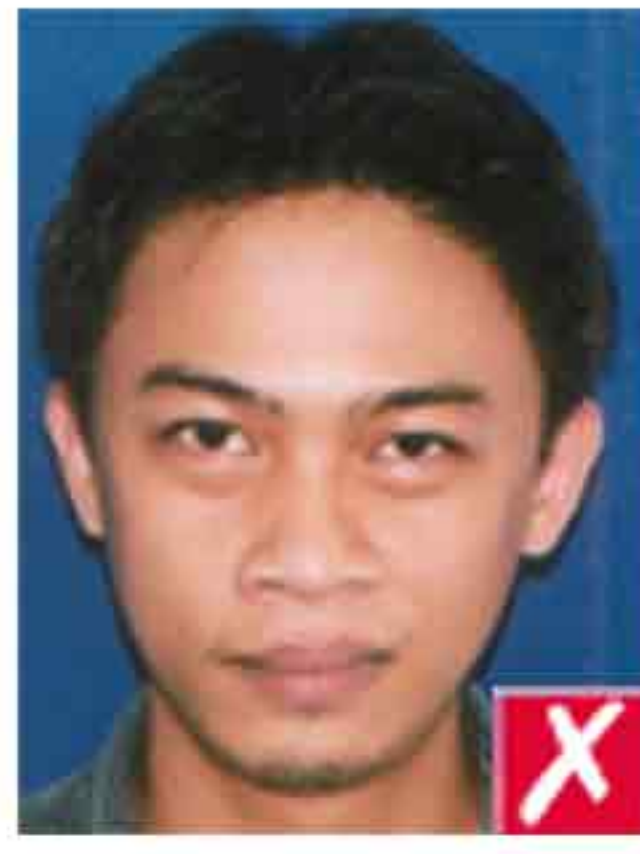
Image of face is too big